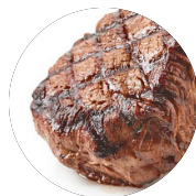
Lean red meats, fish, chicken, turkey