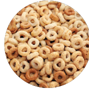
WIC approved cereals