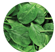
Dark, leafy green vegetables