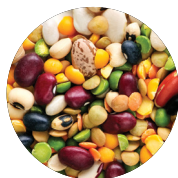
Legumes (peas, beans, lentils)