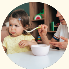
Late introduction to lumpy foods.