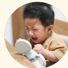
Children who are very emotional.