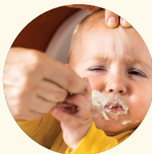
Pressure from parents to eat.